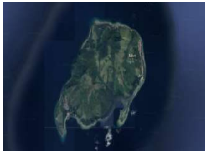
Figure 1. Mare Island, North Maluku (Google Map, 2021)

This study was located at Mare Island, Tidore Islands, North Maluku Province, as shown in Figure 1. This study was a part of the promotion of Sea Water Reverse Osmosis (SWRO) membrane technology by one of the membrane manufacturers from Japan in 2019. The selection of the location provides insight into the forms of adaptation carried out by a small island in eastern Indonesia. Based on Central Bureau of Statistic (BPS) data in 2020, the population of Mare Island is 910 inhabitants, consisted of 488 inhabitants of Marekofo and 422 inhabitants of Maregam